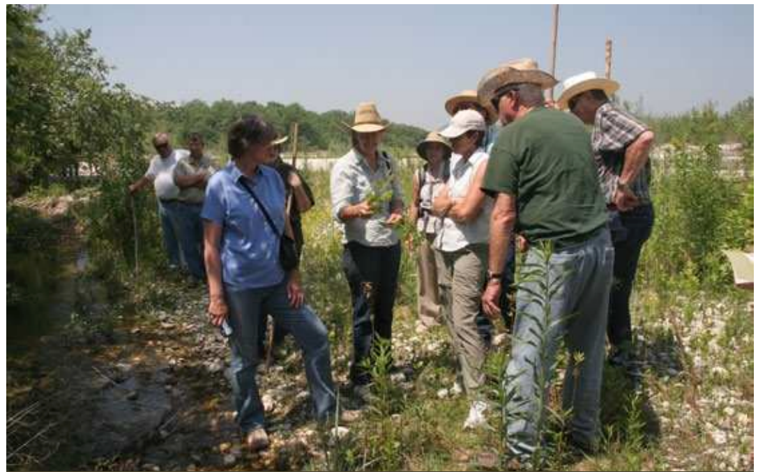
TEACHING THE IDENTIFICATION and value of riparian plants is a key part of a successful workshop.

A frequent comment heard from participants after a workshop is, "I'll never look at a creek the same way again." Lights seem to turn on as riparian dynamics are explained. Most participants have spent their lives around creeks and