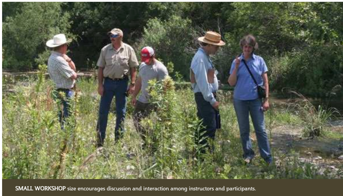
SMALL WORKSHOP size encourages discussion and interaction among instructors and participants.

The opportunities and need for landowner education are great in the Nueces Basin but hardly unique. The Basin's "water catchment" area comprises nearly 11 million acres in the Edwards Plateau and the Rio Grande Plains. This vast area runs from Rocksprings to Corpus Christi and includes thousands of miles of creeks and rivers. The Nueces and its tributaries contribute more than 60 percent of the total water entering the Edwards Aquifer via the critical recharge zone. The Basin also supplies a large portion of the Carrizo Aquifer's recharge and contributes to the recharge of several minor aquifers. The water resources for this part of Texas are vitally important to millions of Texans