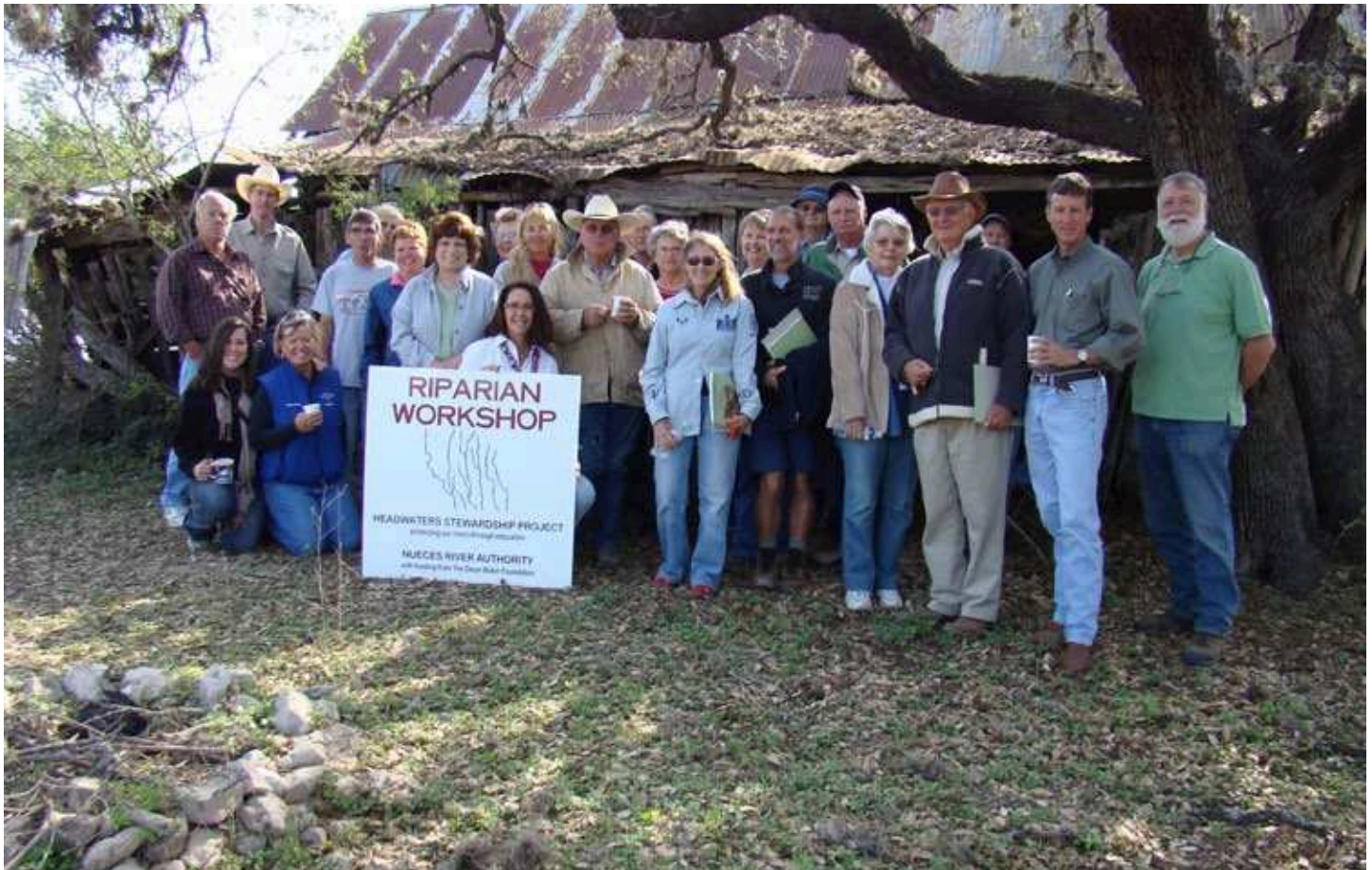
ONE OF THE MORE interesting workshops was held in a barn dating back to the 1800s on the banks of Montell Creek in Uvalde County.

bers. Workshops have been held in ranch homes, hunting lodges, barns and even in an old school house. Landowners have said they appreciate having these workshops out in the country, on their own turf, rather than in town.