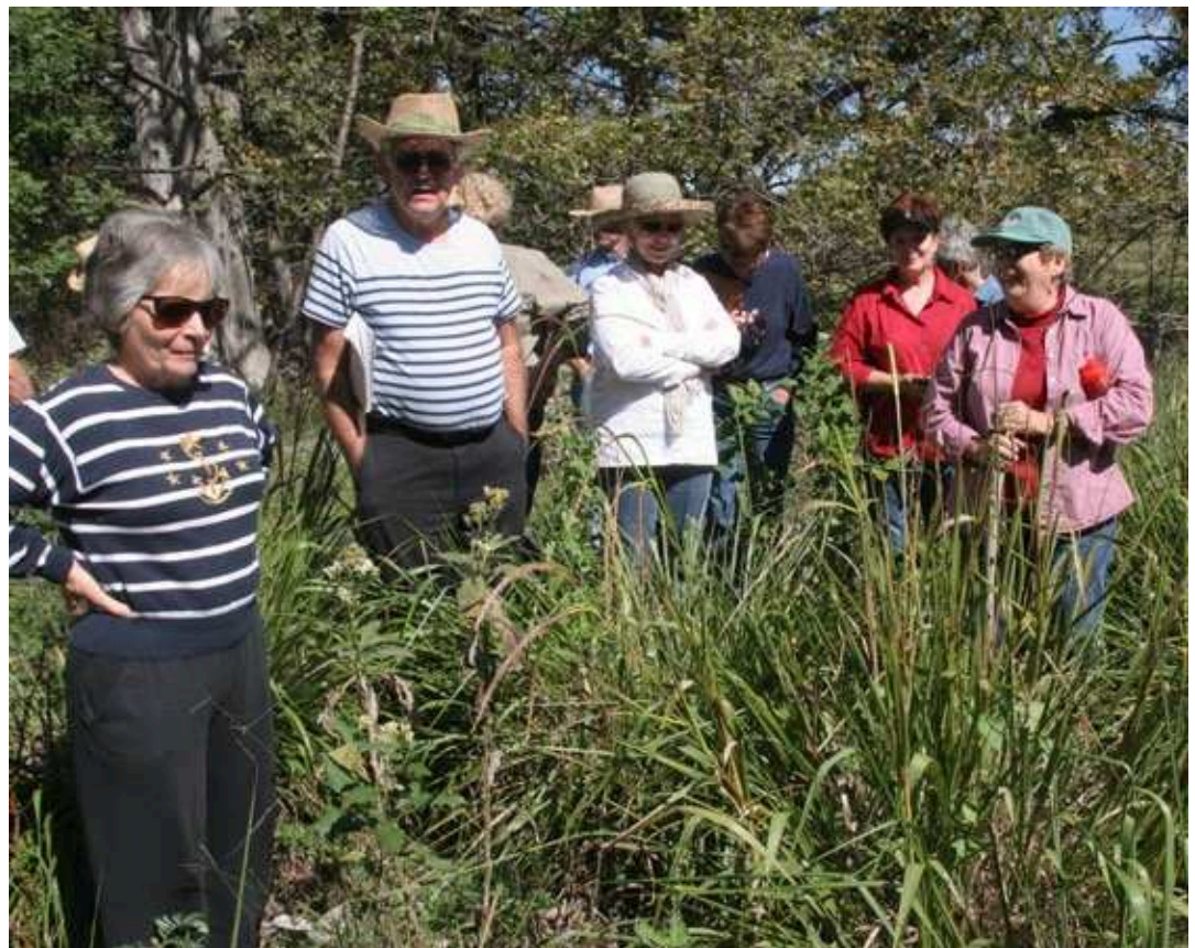
LEARNING TO APPRECIATE and evaluate riparian vegetation on the Sabinal River near Utopia, where most riverfront property has been divided into numerous small tracts.