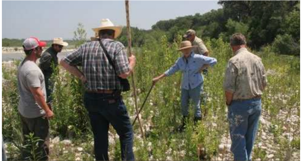
LANDOWNER POINTS out the new regeneration of riparian vegetation on a gravel bar near the confluence of Pulliam Creek and the Nueces River.